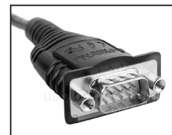
RTU (RS-485) type connection

The load shedding contacts change position when the fire pump controller is connected to the alternate power source and the fire pump is called to start inhibiting the emergency loads to be energized. Once the fire pump starts and runs,