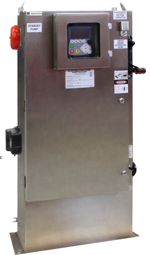
Stainless Steel Brushed Finish

Dust Tight - No ingress of dust; complete protection against contact. Water jets - Water projected by a nozzle (6.3mm) against enclosure from any direction shall have no harmful effects. **